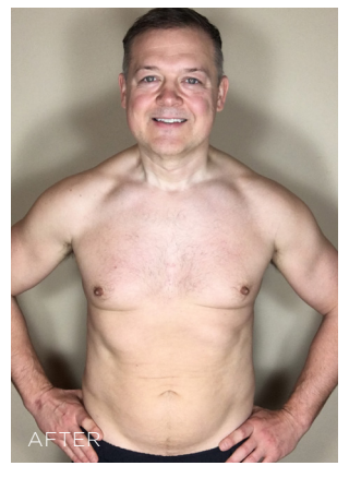
These results are not typical. The Slenderiiz Program helps you take in fewer calories than you burn via calorie-restricted eating, healthier food choices and increased physical activity. You can expect to lose up to 12 to 15 pounds in a month depending on a number of factors.